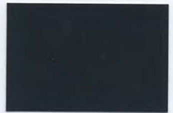
Slate Blue 18B29