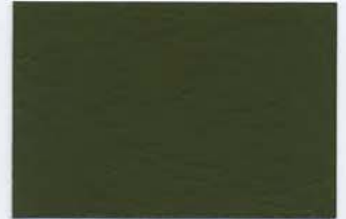
Olive Green 12B27