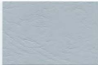
Pigeon Grey 18B17