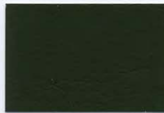
Juniper Green 12B29