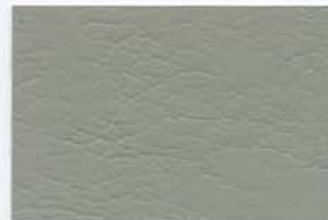
Goosewing Grey 10A05