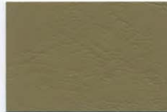
New Grey 10B23