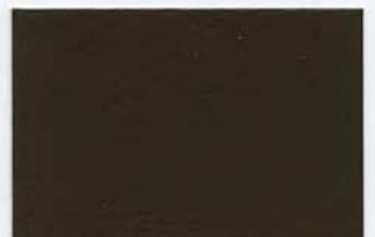
Vandyke Brown 08B29