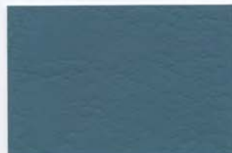
Wedgewood Blue 18C37