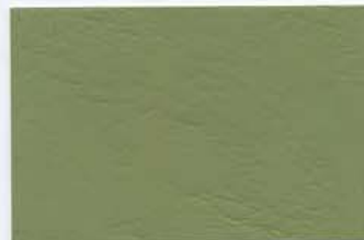
Moorland Green 12B21